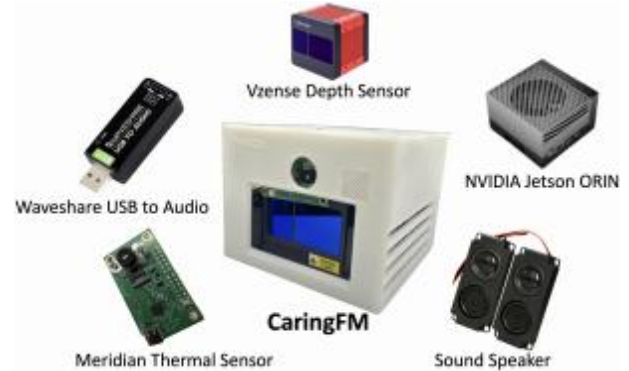
Figure 1: The hardware configuration of CaringFM.

The CaringFM system is developed to monitor human activities, prioritizing privacy considerations. As depicted in Fig. 1, the system's hardware suite encompasses an NVIDIA Jetson ORIN[5] for edge computing of up to 200 trillion operations per second (TOPS), Vzense DS77 [6], a privacy-conscious indirect-Time-of-Flight (iToF)